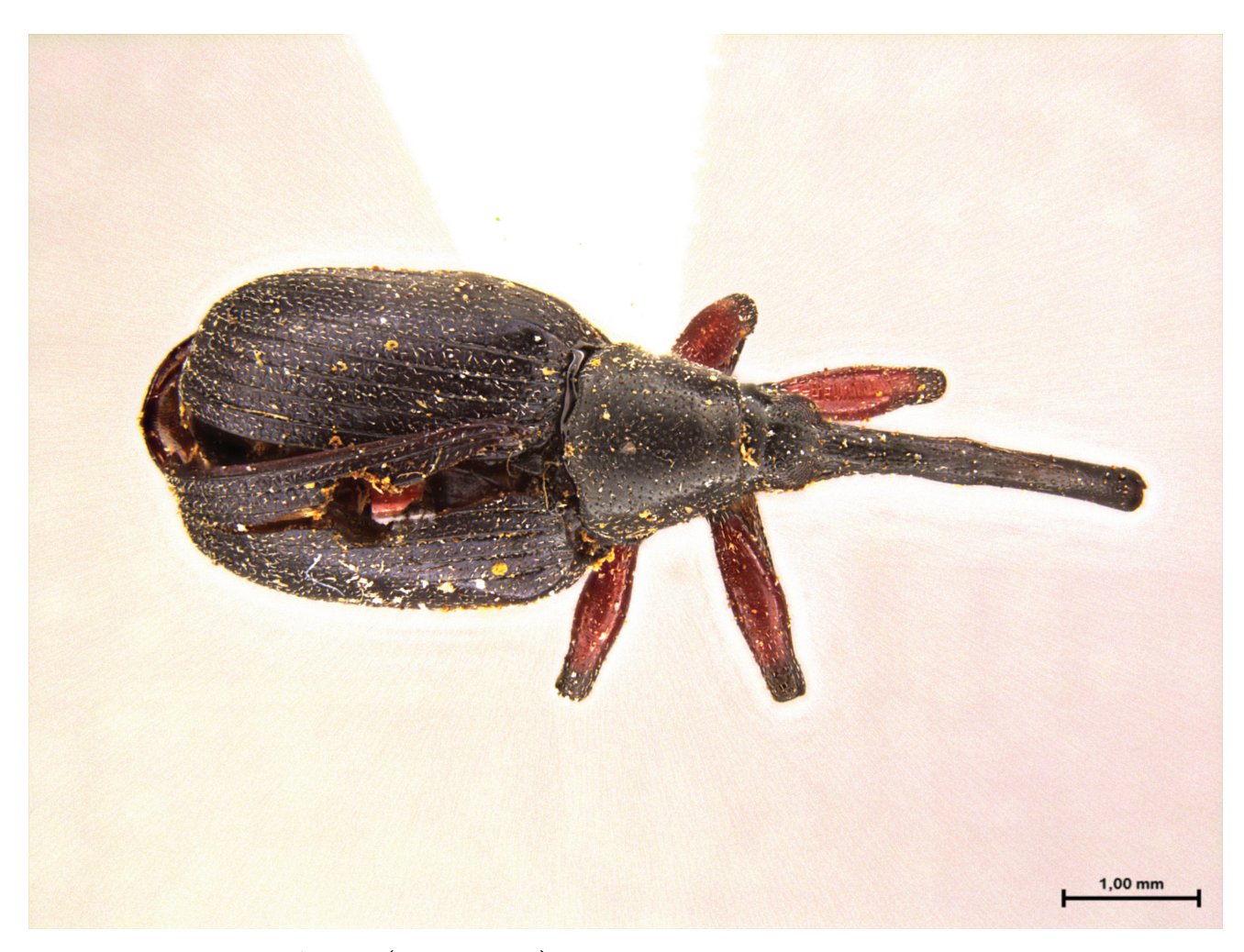
Fig. 1.— Lectotype of Pnoia femoralis (Fabricius, 1801), habitus, dorsal view.