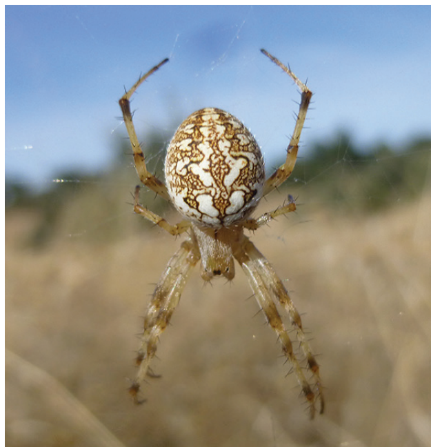
Fig. 1.— Neoscona byzanthina (Pavesi, 1876). Dorsal view.

Thus, we provide the first data about the presence of N. byzanthina in the Iberian Peninsula. The habitat corresponds to an open holm-oak dehesa (a typical Mediterranean agro-forestry-pastoral ecosystem) of Quercus rotundifolia Lam., with a low load of bovine