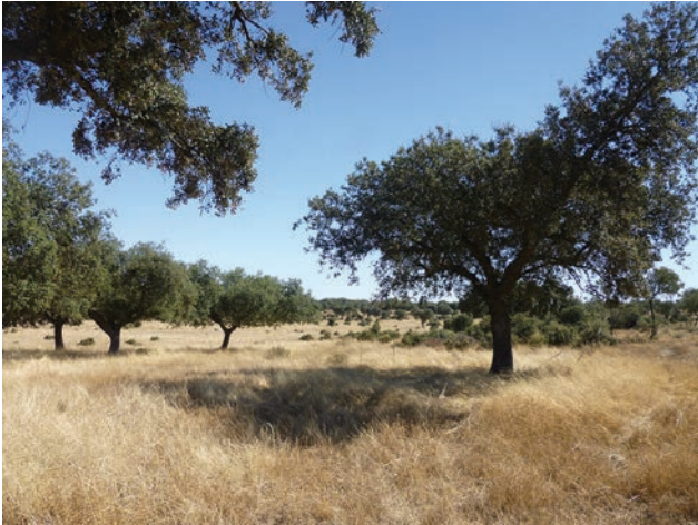
Fig. 3.— Habitat of N. byzanthina (Pavesi, 1876). Olivenza, Badajoz.