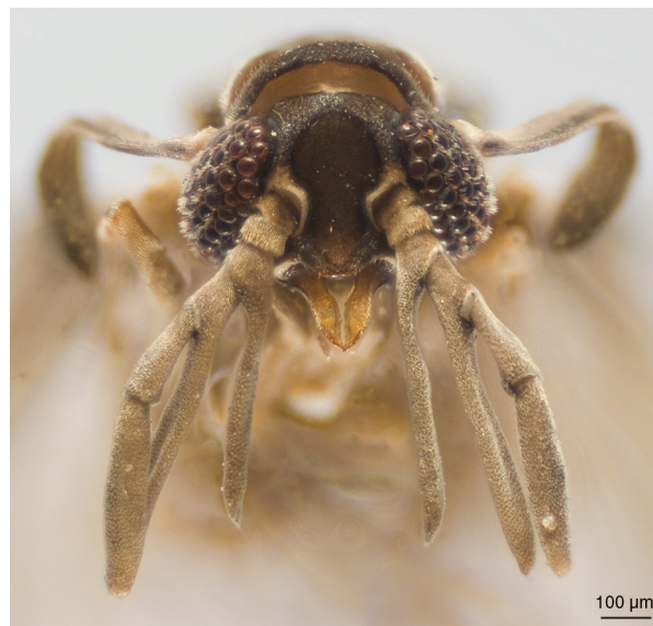
Fig. 1.— ♂ Eoxenos laboulbenei frontal view (Spain, Balearic Islands, Majorca); photomicrograph.

MATERIAL EXAMINED. Eoxenos laboulbenei . Spain, Balearic islands, Majorca, Felanitx, cattle farm Ca's Boter, 20 ♂♂, 39°30'N, 03°07' E, x. 2012, black light, leg. R. del Río & C. Barceló (19 ♂♂ in ethanol, 1 ♂ critical point dried).