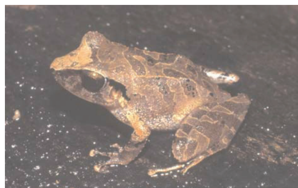
Fig. 3.— Eleutherodactylus skydmainos from Río Negro, Pando, Bolivia (LG).

This is the most common species in the Andean Humid Forest of Bolivia. It has been recorded in the departments of Cochabamba, La Paz, and Santa Cruz (De la Riva et al. , 2000). The only previous record from Beni was the holotype of E. bocker-manni Donoso-Barros (a junior synonym of E. platydactylus ), purportedly from Rurrenabaque, although this locality is doubtful (see De la Riva, 1987). These 15 specimens from humid montane forest constitute the first confirmed departmental record.