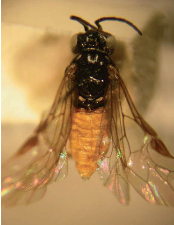
Fig. 3.— Pristiphora nievesi sp. n. holotype.