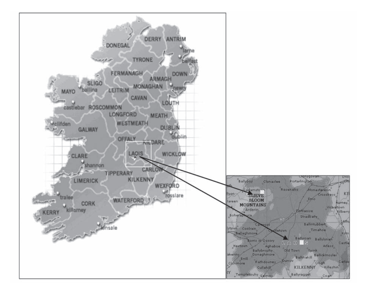
Fig. 1.- Location of the Baunreagh and Dooary Sitka Spruce stands in Co Laois, Ireland.

Fig. 1.- Localización en el condado de Laois (Irlanda) de las plantaciones de Baunreagh y Dooary.