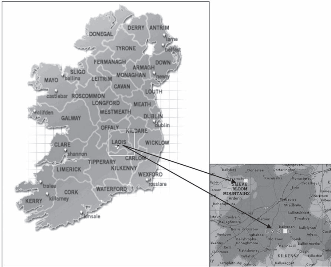
Fig. 1.— Location of the Baunreagh and Doory Sitka Spruce stands in Co Laois, Ireland.